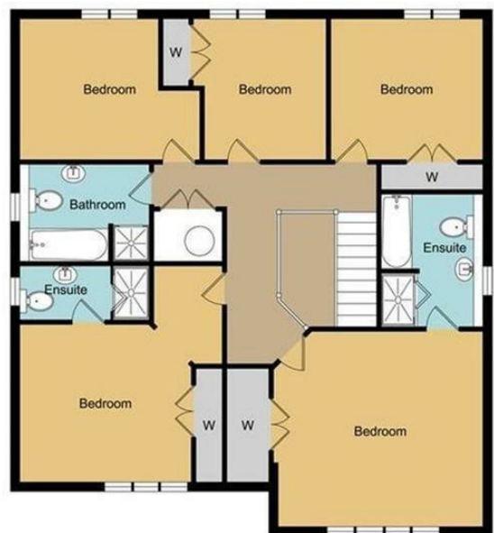
First Floor Approximate Floor Area 1120.2 sq. ft. (104.07 sq. m)

TOTAL APPROX FLOOR AREA 2411.22 SQ. FT. (AREA 224.01 SQ. M) Measurements are approximate. Not to scale. Illustrative purposes only.